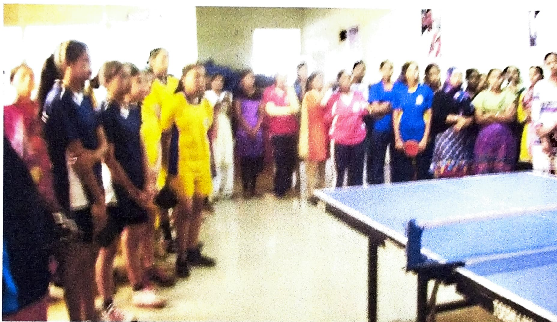
Players from various colleges participated in the Inter-collegiate Table tennis Tournament

Date and Venue: 21 st and 22 nd December 2016, Karnataka State Women's University's Indoor Hall.