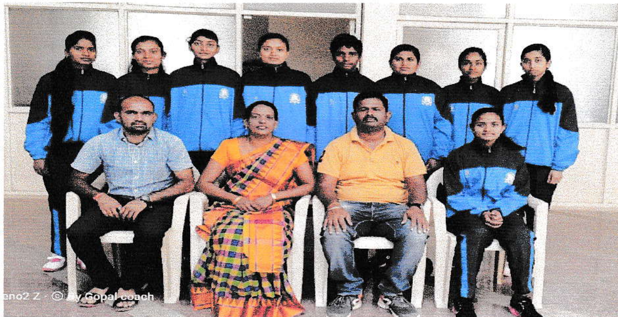
Karnataka State Akkamahadevi Women's University's Athletic team with University Staff

Date and Venue: From 2 nd to 6 th January 2020, Rajiv Gandhi Health Science University, Bengaluru