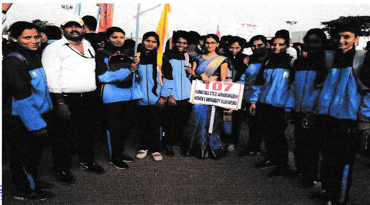
Karnataka State Akkamahadevi Women's University's Athletic team at Rajiv Gandhi Health Science University, Bengaluru