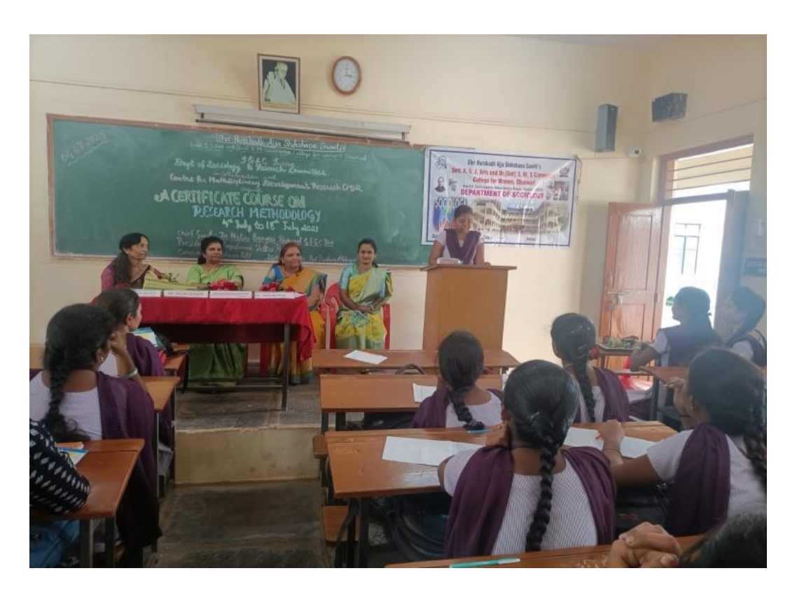
Vote of thanks by a student