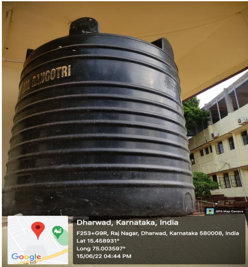
Figure 3. Overhead Tank