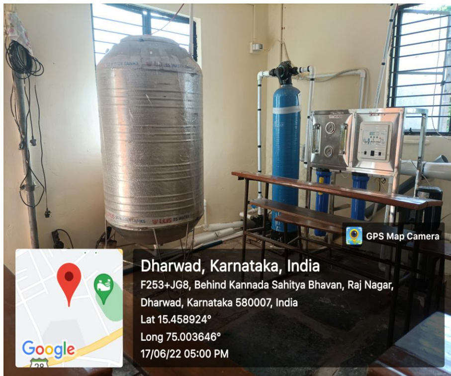
Figure 4. R.O Unit