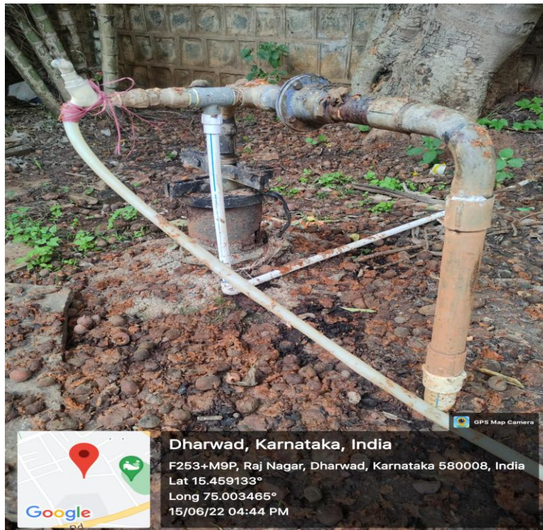
Figure 2 Borewell