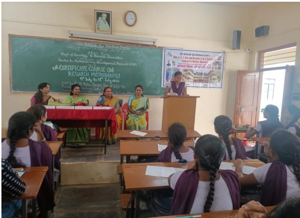
Vote of thanks by a student