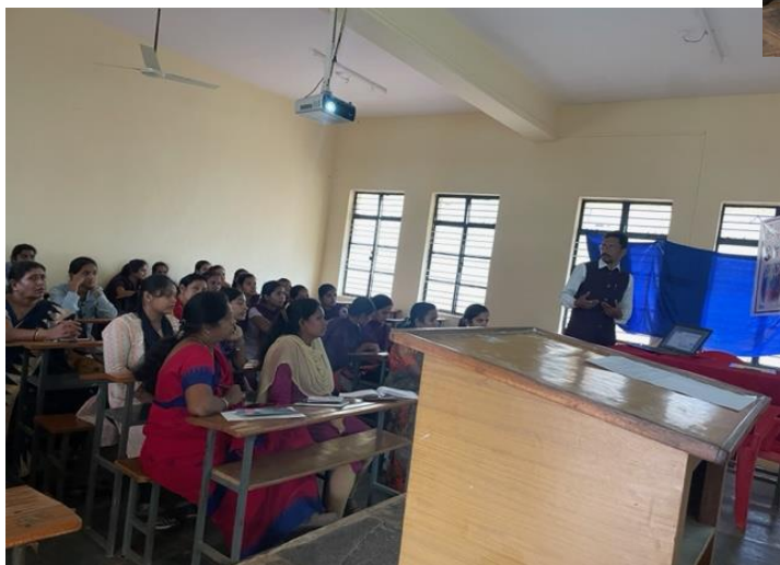
A Session on 'Application of KOBO Technology and SPSS in Research'